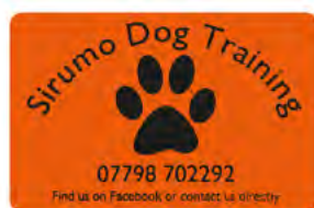
Sirumo Dog Training www.facebook.com