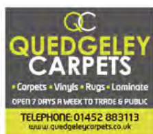
Quedgeley Carpets www.gloucestercarpetshop.com