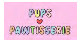
Pups Pawtisserie www.facebook.com