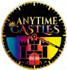
Anytime Castles www.anytimecastles.co.uk

Special thanks to Cotswold Printing for their continued support.